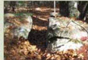
3 Split Rock