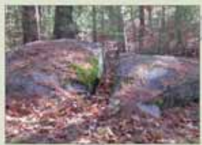
2 Picnic Rock