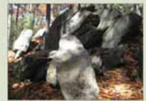
1 Ledge Outcropping